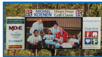
◁ The 7th Annual Dream House Golf Classic raised over $38,000 to fund direct nursing care in April for children at the Transition Care Home in Lilburn.

Camp Inspiration, created and sponsored by the Jesse Mercer Stewards of Mercer University's Atlanta campus, was held in April for Dream House kids and their families. It was so successful, they are planning another event in the Fall. ▷