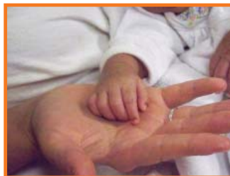
ABOVE: This precious baby has already captured our hearts!

The afternoon of June 17, a Meriwether County DFCS case manager was faced with sending a medically fragile preemie