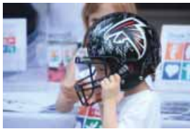
PHOTO HIGHLIGHTS: www.DreamHouseForKids.org Meet our Atlanta Falcons Guests, Sponsors and Dream House Golf Participants.

To benefit Dream House for Medically Fragile Children, Inc.